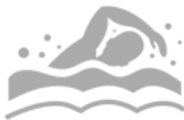
Air or Water