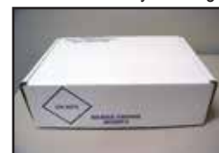
KY Division of Laboratory Services ATTN: Virology 100 Sower Blvd. Ste 204 Frankfort, KY 40601

Refer to 49CFR 173.199 for current regulations on packaging and shipping of Category B infectious substances