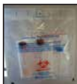
Place specimen in tube shuttle, put in 95kPa bag and seal