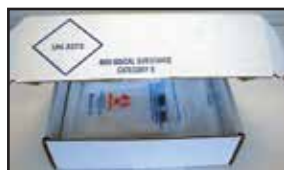
Place specimen bag on top of frozen cold pack and replace styrofoam lid