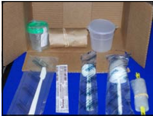
1— Food Collection Kit