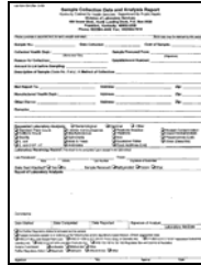
1—Submission Form LAB 504