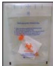
Place tube inside bag with absorbent