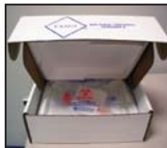
Place sample bag on top of frozen freezer block and replace styrofoam lid.