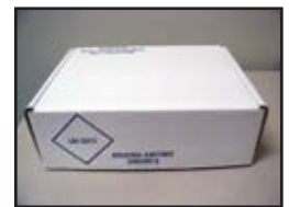
Close box and Place appropriate label on top of the box