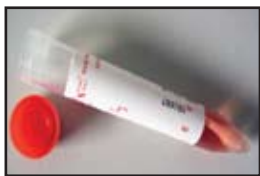
Break off swab into transport media