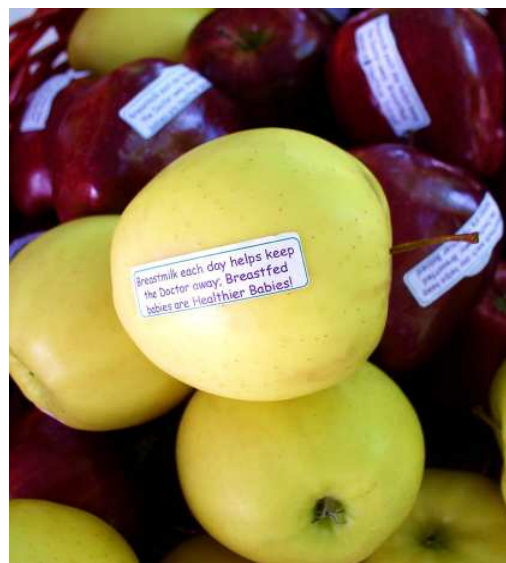
Apples from Ashland's "Longest Day of Play".