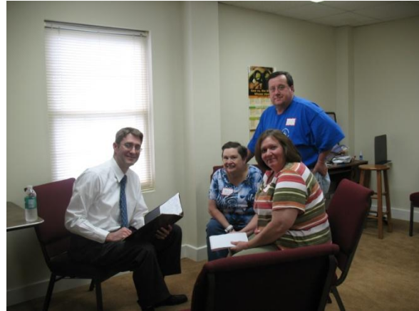
A family that participated the “Future is Now” project, discussing their plans for their daughter with an attorney.

but also by the fact that the program has brought together families of all ages and can be replicated throughout the state.