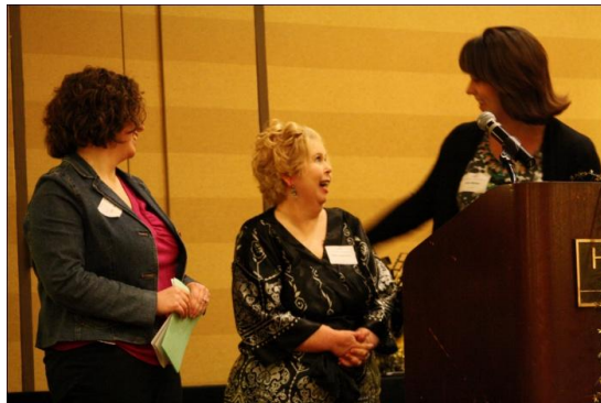
DSP’s accepting awards at the annual SPEAK banquet for outstanding work in their field.

The participating providers host an annual DSP banquet to celebrate and acknowledge the successes of DSP’s in Kentucky. SPEAK activities have reduced turnover rates, improved