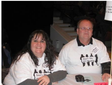
KYSAFF advocates attending meetings and trainings

Kentucky Self Advocates for Freedom (An organization run by people with developmental disabilities active in advocacy, policy and systems change)