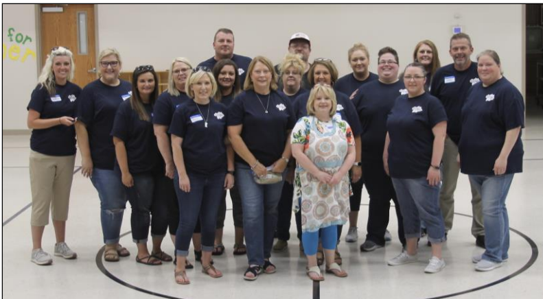
Eastern Mountain Service Region Retention and Morale Committee

The 21-member Eastern Mountain Service Region Retention and Morale Committee The EMSR Morale committee goes above and beyond in their retention work. The group of 21 Ambassadors have done awesome work during 2021 to provide all employees with special recognition. Ambassadors were chosen for their empathy and the respect they display to others.