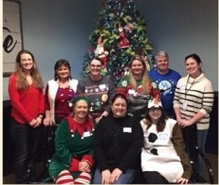
The DPP Adoption Branch helped host a Christmas party for children registered with KAPE in Lexington at Gatti Town on December 12, 2019.