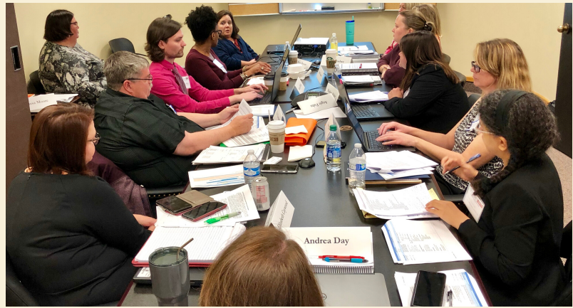
DCBS met with the federal Administration for Children and Families to review Kentucky's compliance with the Child Care and Block Grant on November 5-7.