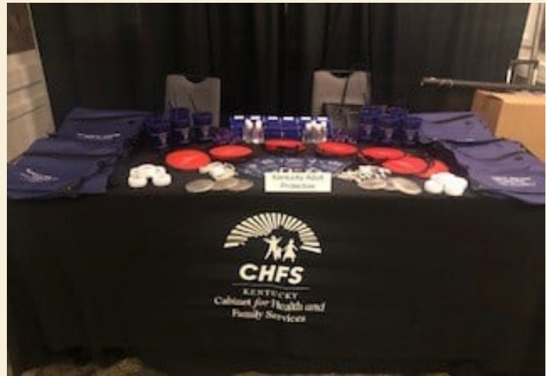
APS staff hosted an information table at the National Guardianship Association Conference in Lexington on October 13 and 14. Branch staff shared public awareness information with conference attendees.