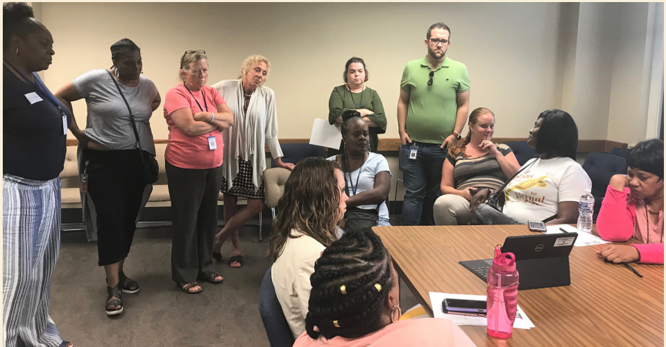
Jefferson County START staff recently viewed the web training on "Using Narcan Nasal Spray for Opioid Overdose Emergencies."