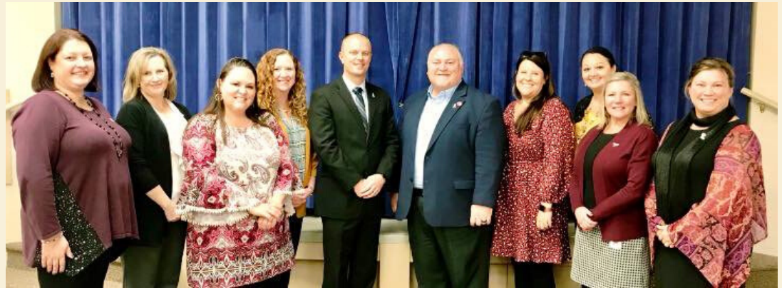
DCBS leadership pose wearing their white ribbon pins to encourage adoption awareness.

November is Adoption Awareness Month. DCBS and its partners are coordinating several projects to encourage more families to explore adoption. Here are a few projects.