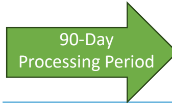
Updated 2024 CMS Monthly Reports*