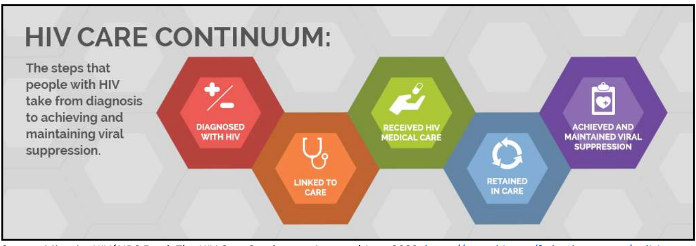
Figure 1. HIV Care Continuum

The Integrated Plan utilizes the HIV care continuum model and the Status Neutral Approach. The HIV care continuum, illustrated in Figure 1, depicts the stages a PWH engages in from initial diagnosis through their successful treatment with HIV medication to reach viral suppression. Supporting PWH to reach viral suppression not only increases their own quality of life and lifespan, but also prevents transmission to an HIVnegative partner, thus providing an additional strategy to prevent new HIV infections.