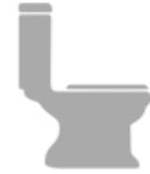
Sharing Toilets, Food, or Drinks