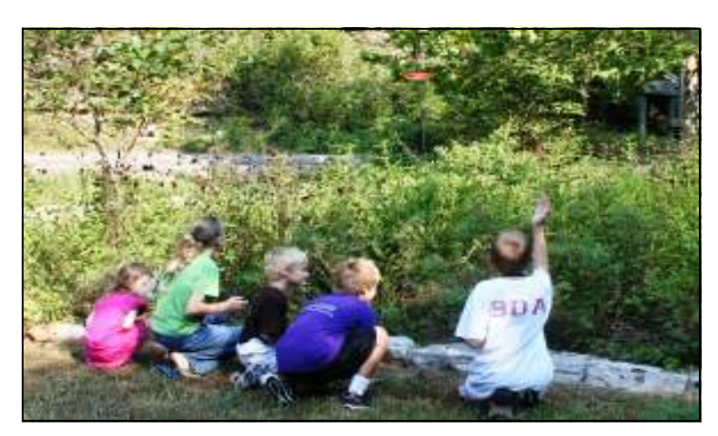
Cove Springs Hummingbird Workshop