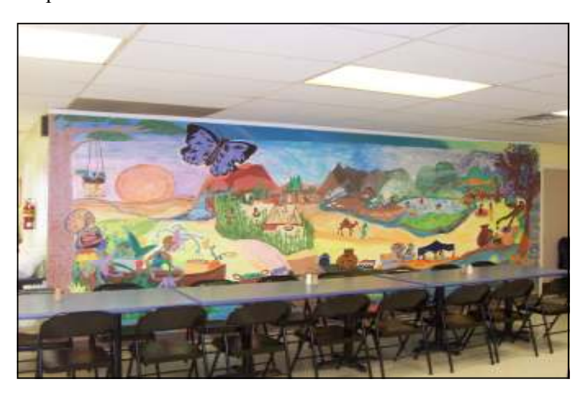
Access Soup Kitchen and Men's Shelter