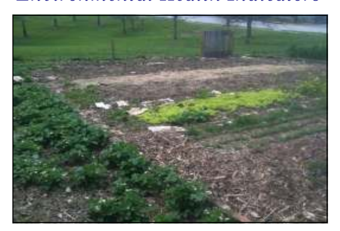
Figure 2. Community Garden on Logan St.