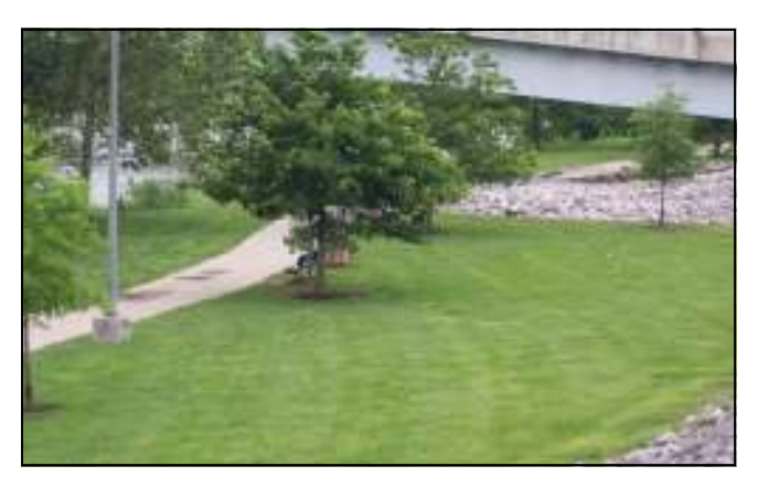
Figure 4. Kentucky River Trail at Riverview Park