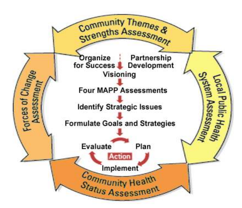
Figure 1. MAPP Community Strategic Planning Process

This document presents the findings of the four MAPP assessments that were initially collected by four MAPP subcommittees between December 2008 and November 2009. Assessment data was updated between June and September 2011 for the revision of the Franklin County MAPP Community Health Improvement work plan (2011).