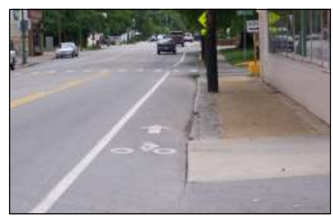
Figure 5. Bike Lane on Second St.

healthy food and beverage options and portion sizes at retailers, community gardens (see Figure 2), farmers markets (see Figure 3) and transportation to grocery stores. The environmental factors considered for physical activity included sidewalks, land use plans, walking and biking infrastructure such as paths, trails (see Figure 4) and dedicated lanes (see Figure 5), parks and recreational facilities (see Figure 6).