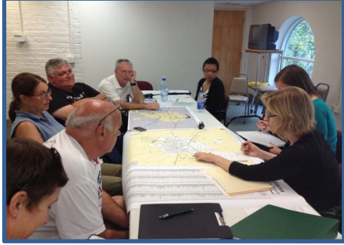
Design Charrette with Walk Bike Clark County team members.

Promoting Health Equity Office of Health Equity 2013 Mini-Grant Final Report