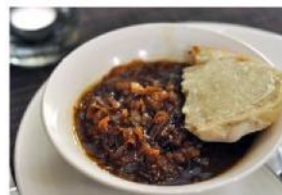
French Onion Soup

In a sauté pan over medium heat add oil, heat and add onions and salt. Cook the onions until they are caramelized, about 20 minutes. Remove from heat and set aside to cool. Mix the rest of the ingredients and then add the cooled onions. Refrigerate and stir again before serving.