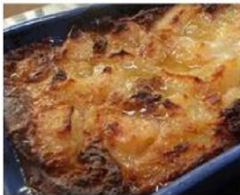
Easy Pear Cobbler