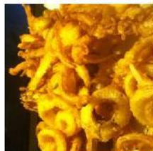
Fried Onion Rings

Preparation: Trim the ends using a sharp knife. Then peel the outer 2-3 layers of skin until you find fresh thick pinkish-white whorls. You can slice or cut them into fine cubes depending upon the recipe type.