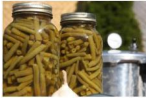
Canned Fresh Green Beans

This is a great first recipe for the beginning pressure canner.