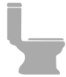
Sharing Toilets, Food, or Drinks