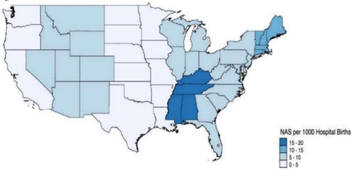
Figure 1: Geographic Distribution of Neonatal Abstinence Syndrome in the US.

Source: Kentucky Cabinet for Health and Family Services. Neonatal Abstinence Syndrome in Kentucky: Annual Report on 2016 Births. Frankfort, KY: KY Cabinet for Health and Family Services, Department of Public Health, Division of Maternal and Child Health, 2018.