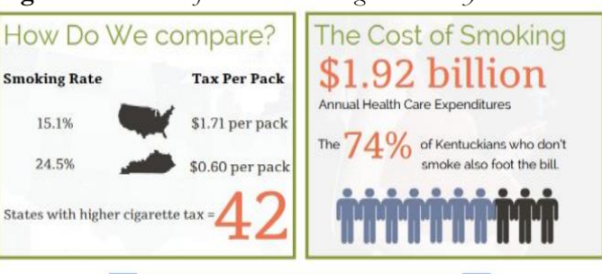
Figure 1: The Cost of Tobacco Smoking to Kentucky

Nationally, estimated smoking-related health costs and lost productivity total $19.16 per pack